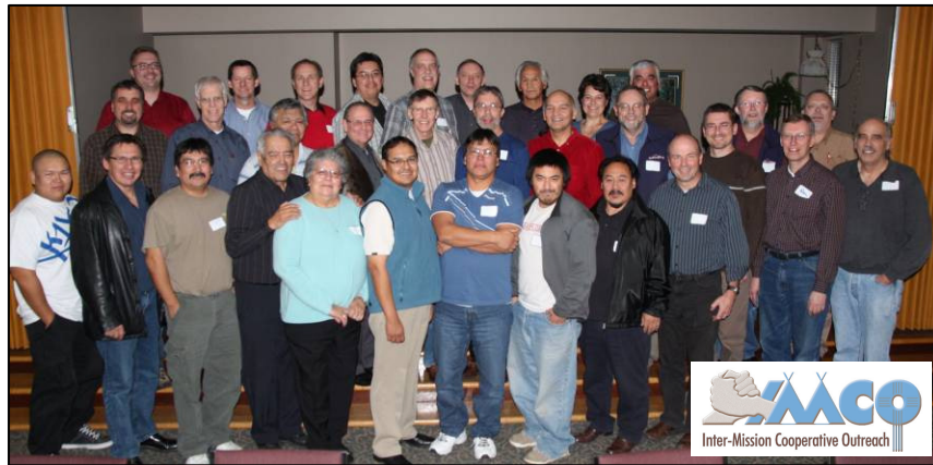
IMCO delegates convened for a November 2008 gathering.

InterMission Cooperative Outreach (IMCO) is a collaboration of 11 agencies, including InterAct Ministries, serving among Canada's First Nations communities.